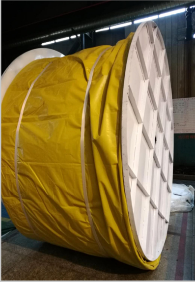
EXCELLENT LEAD TIME