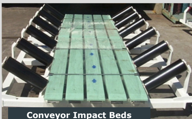
Conveyor Impact Beds