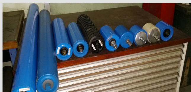
HDPE/ RUBBER/ ALUMINIUM/ STEEL IDLER ROLLERS AVAILABLE IN ANY SIZE MADE TO ORDER