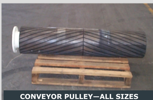
CONVEYOR PULLEY—ALL SIZES