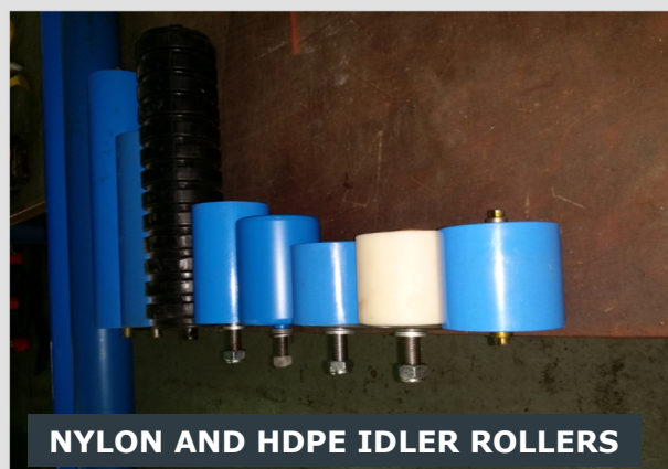
NYLON AND HDPE IDLER ROLLERS