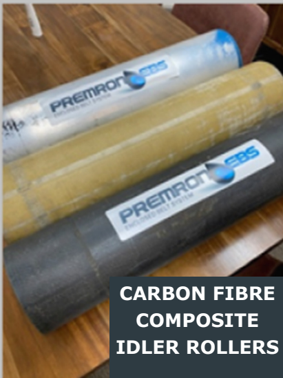
CARBON FIBRE COMPOSITE IDLER ROLLERS

OUR ROLLERS ARE 5X STRONGER, 40X MORE STABLE (TEMP RISE) THAN ALUMINIUM AND LIGHTER THEN STANDARD IDLER ROLLERS